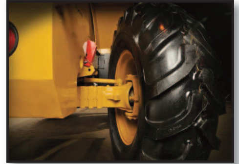
STEERING CONTROL: 4 Wheel steering with tight turning radius and exceptional ground clearance.