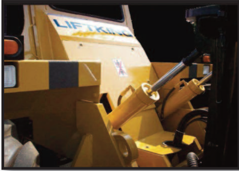
PROTECTION: Fully enclosed and protected electric and hydraulic systems